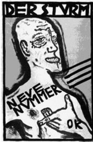
Fig.4-Kokoschka's Selfportrait, Der Sturm, 1910

Kokoschka did not die in combat in opposite trenches.