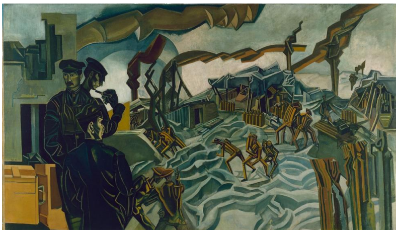
Fig. 9 – Wyndham Lewis's A Battery Shelled , 1919.

Abstractionism emerges with the eminence of war. As war shakes every necessity of abstraction from daily life, the intention of establishing rupture both socially and aesthetically was ironically being materialized. The need to feel normality was coming back. But Normality had changed: it turned out to be looked from inside and from outside simultaneously. In “Essay on the Objective of Plastic Art in our time”, Lewis asserts: