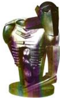
Fig. 3 - Jacob Epstein: Rock Drill, (1916)

Wyndham Lewis's attitude - both as an artist and as an individual – encompassed by civilization, leads him to assert, in the manifesto “The Art and the Race” ( Blast 2 – War Number, 1915), that the universality of an artist walks on the ground of detachment from circumstantiality, in order to become a unique being integrating humanity.