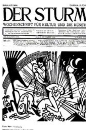
Fig.5- Franz Marc's illustration for Else Lasker-Schüler's Poem Reconciliation [Versöhnung]

Published seven weeks before the Britain's entrance into the First World War, BLAST magazine also gives an alluring clairvoyance into the combative cultural disposition in London at the outbreak of war: It's all a matter of most delicate adjustment between voracity of art and digestive quality of life." (Lewis, Blast 1, 1914).