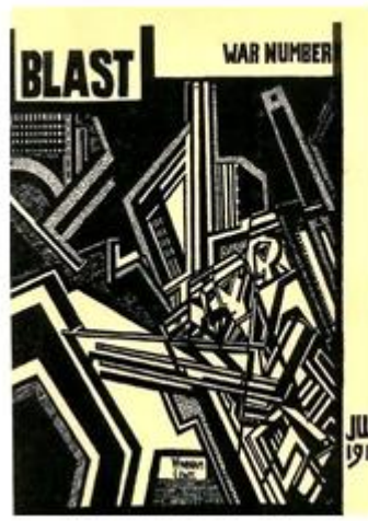
Fig. 7 - Blast 2, 1915