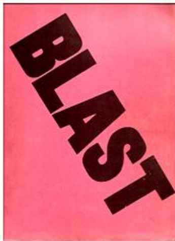
Fig. 6 - Blast 1, 1914

Published seven weeks before the Britain's entrance into the First World War, BLAST magazine also gives an alluring clairvoyance into the combative cultural disposition in London at the outbreak of war: It's all a matter of most delicate adjustment between voracity of art and digestive quality of life." (Lewis, Blast 1, 1914).