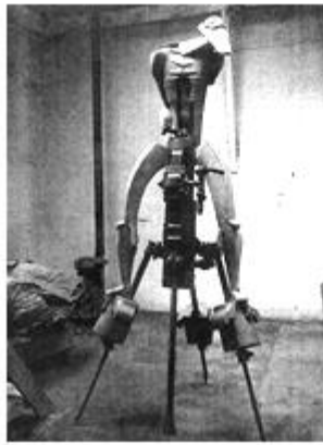
Fig. 2 - Jacob Epstein: Rock Drill, (1913-14, peça original)

carrying within itself its progeny” – as we can read at the explanatory note of the sculpture at Tate Britan –, became a symbol of the new age. Following the carnage of the First World War, Epstein removed the drill, cut the figure down to half-length and changed its arms. This torso was cast in bronze, mutilated and deprived of its virility. The once threatening figure is now vulnerable and impotent, the victim of violence of modern life – both due the physical and metaphysical shock of the trenches and due to the struggle for existence and co-existence with the refinements of the intellect. That may explain why, “art became to be seen as a kind of ‘advanced guard’ for social progress as a whole” (Wood; Edwards: 187).